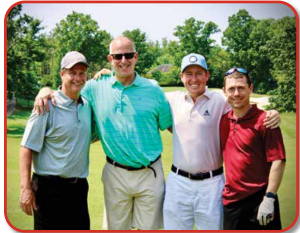
President's Flight Winners | Bankers Insurance