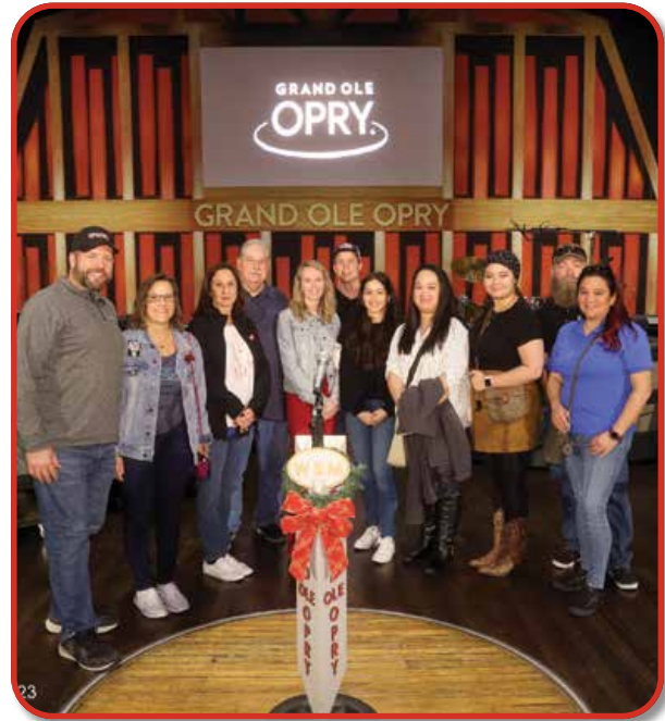
Foundation members were invited to attend the Christmas Special taping earlier in December!

The exposure that resulted from the partnership was instrumental in helping the Program achieve record breaking milestones in 2023. We are extremely grateful for the partnership and the country music stars that came together to spread Toys for Tots' mission across their social platforms—helping bring joy to millions of children in need nationwide.