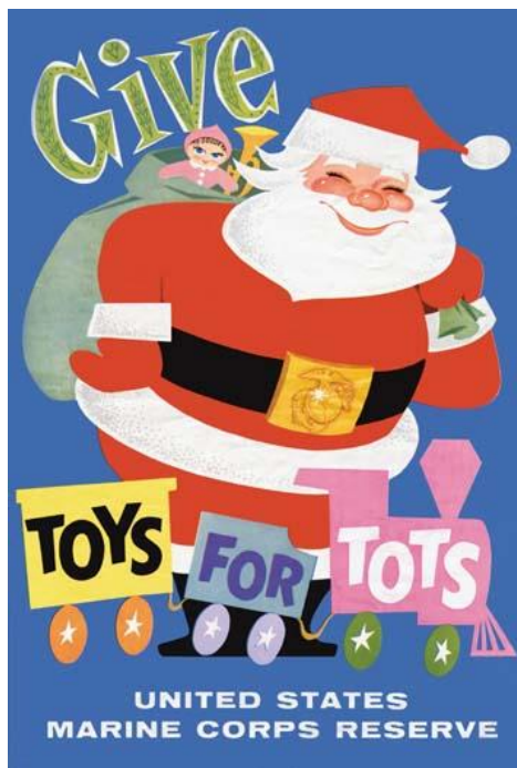
First Toys for Tots Poster (Designed by Walt Disney)