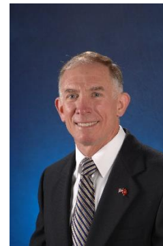
President and CEO